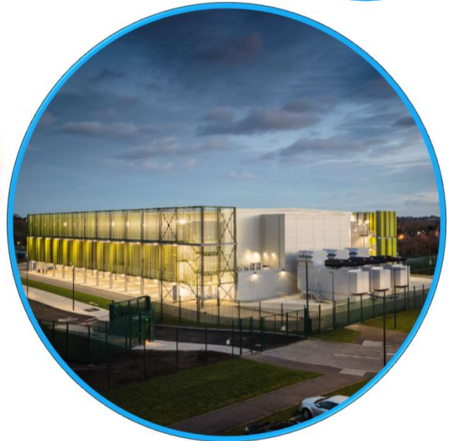
Kao Data's data centre in Harlow, Essex

Cambridge Science Centre have teamed up with Kao Data – one of the UK's largest data centres. Data centres look after lots and lots of computers which together provide the computing power behind many of the everyday things we use today. Every time you stream music, or a film, watch YouTube, play an online game, like a Facebook post, send an email, reply to a text – you are using a data centre!